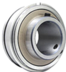
ER203 Bearing 2D drawings and 3D CAD models